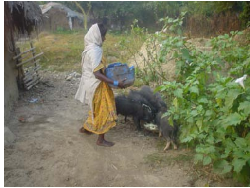
Use of kitchen waste for feeding pigs