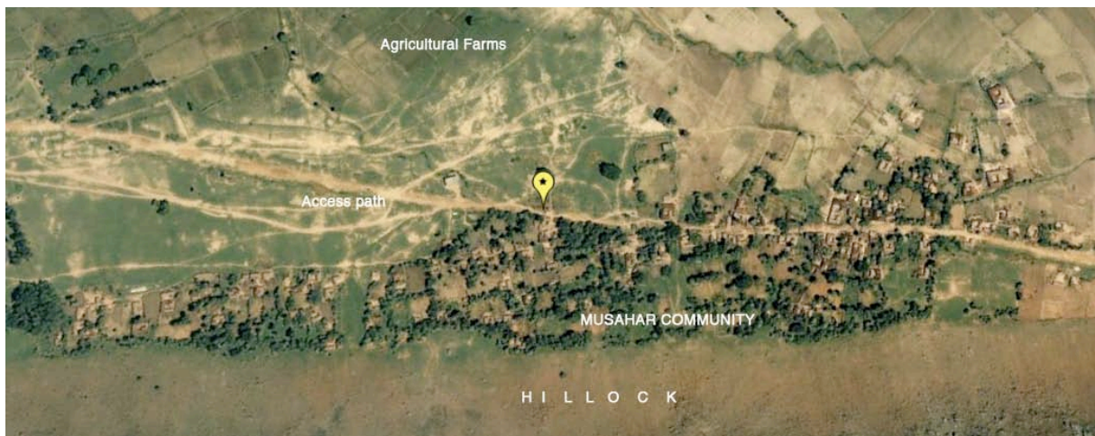
Musahar Community Settlement at Shankardas Nawada