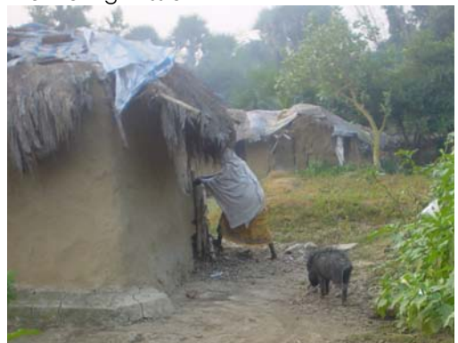
View of habitation st Shankardas Nawada