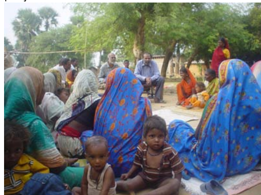
Meeting with women SHG members during monitoring mission