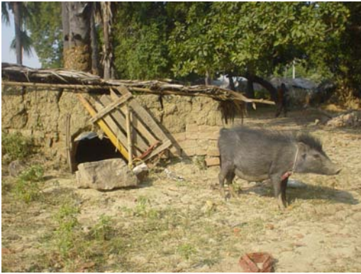
Existing piglet shelters in use