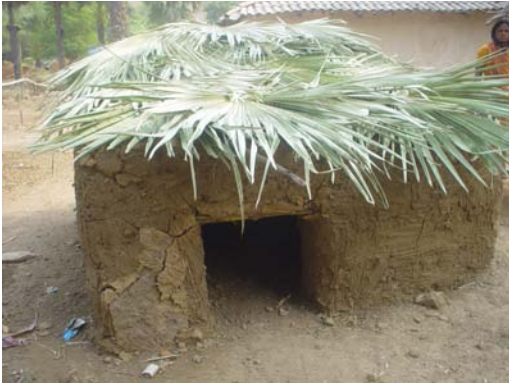
Piglet shelters built under the project