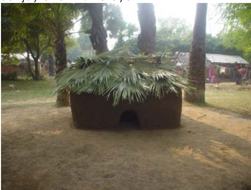
Piglet shelter and cleanliness