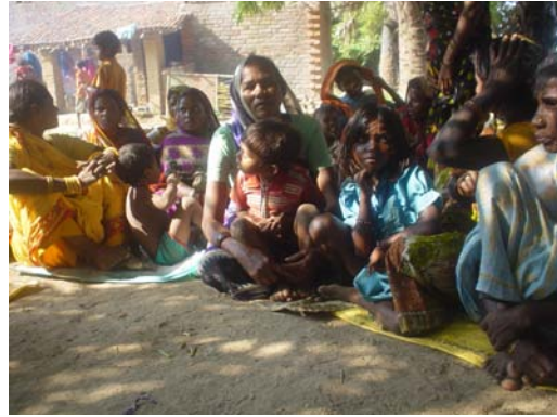
Women SHG members participating in project